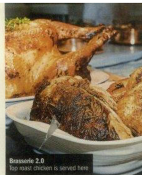
Brasserie 2.0 Top roast chicken is served here

Oh, and there's a special kids' menu, too, which is completely free for little ones under the age of 12. You're welcome. Dhs150 (two courses), Dhs195 (three courses), free (children under 12). Sat noon-3pm. Marina Social, InterContinental Dubai Marina (4446 6664).